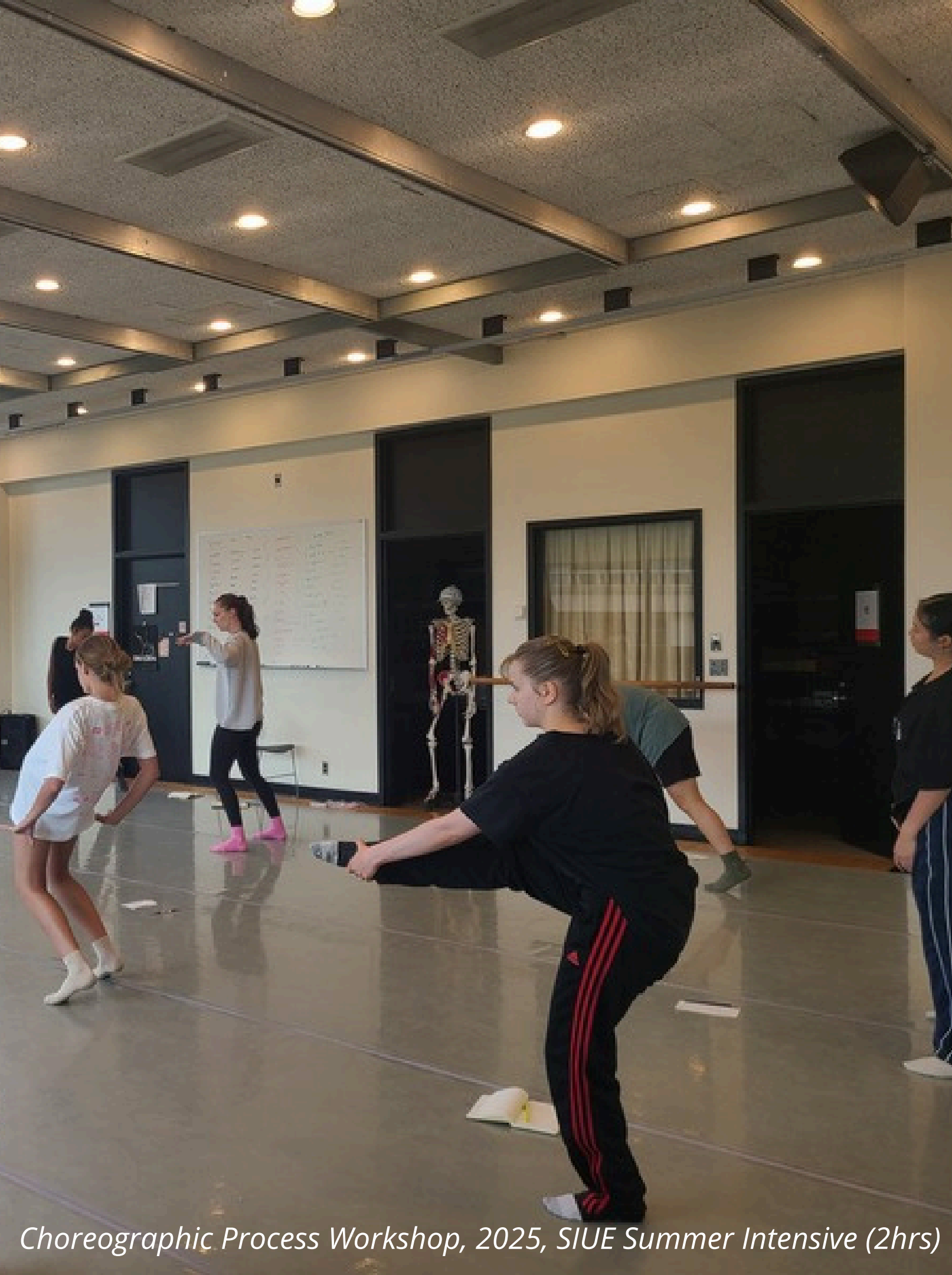
Choreographic Process Workshop, 2025, SIUE Summer Intensive (2hrs)