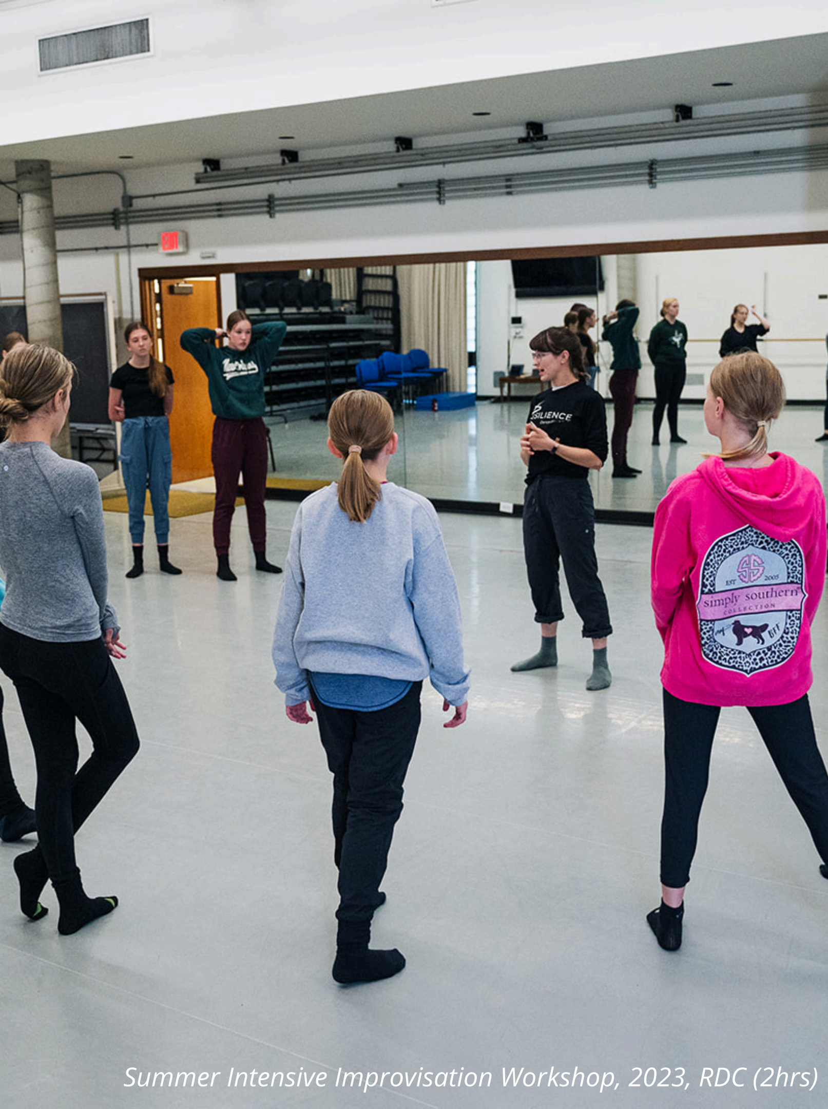
Summer Intensive Improvisation Workshop, 2023, RDC (2hrs)